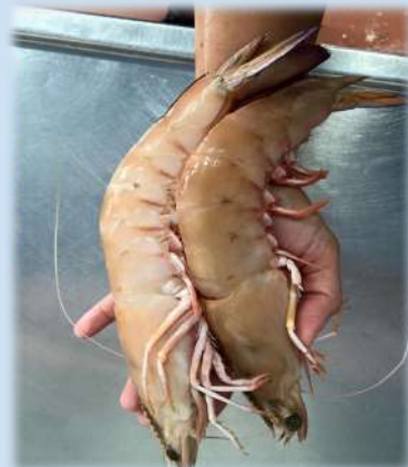
PRAWNS WHOLE GREEN YAMBA U6 XL R/W