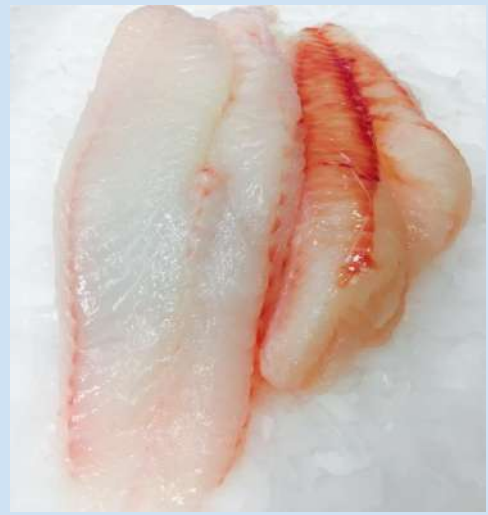
ORANGE ROUGHY FILLET S/OFF NZ 250GM + R/W