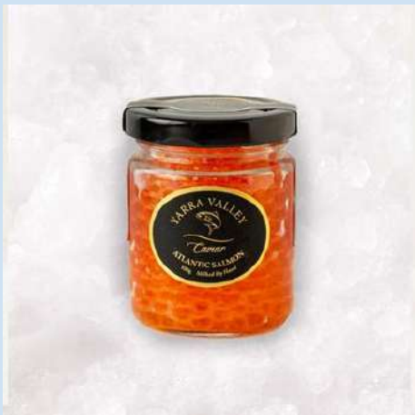
SALMON ROE 100GM TASI