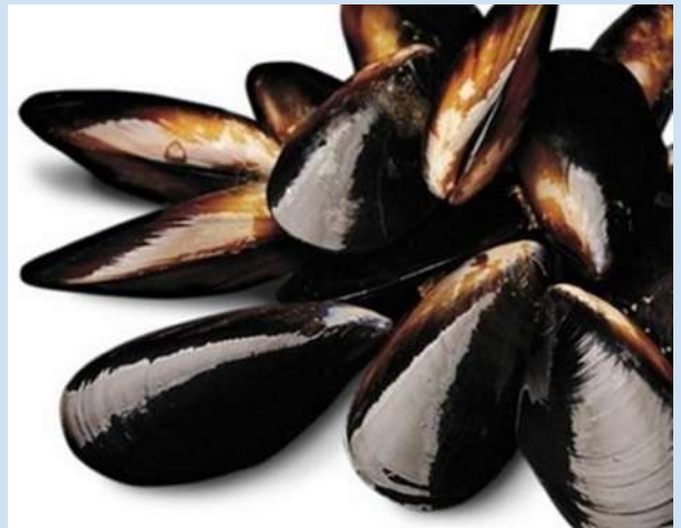
MUSSELS S/AUST KINKAWOOKA SA R/W