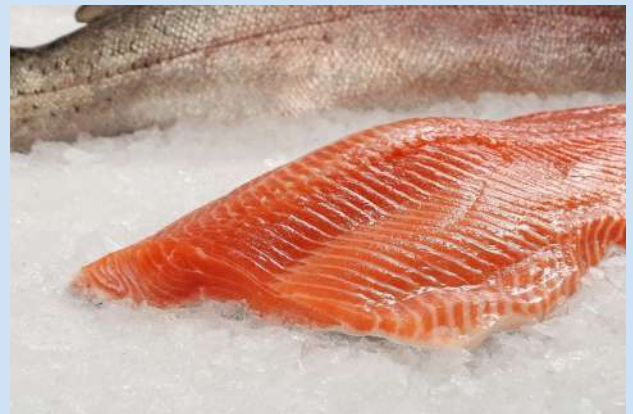
SALMON FILLET S/ON TASI SASHIMI 1.5- 2KG R/W