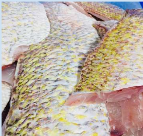
SNAPPER GOLDBAN FILLETS S/ON 500GM + R/W W.A