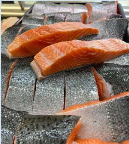
SALMON PC S/ON 200GM EACH BLOCK CUT TASI HUON