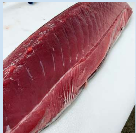
TUNA LOINS SASHIMI ULLADULLA NSW FRESH A GRADE R/W