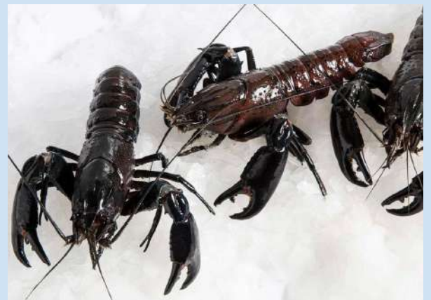
LIVE MARRON 180GM AVG R/W

Item to be pre-ordered, please call your Rep