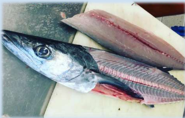
SPANISH MACKEREL FILLET S/ON COFFS 2KG + R/W