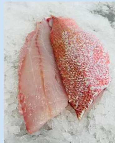
SNAPPER FILLETS RED S/ON SOUTH AUST 400GM + R/W