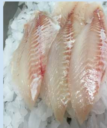
BREAM FILLET S/OFF 125GM + R/W