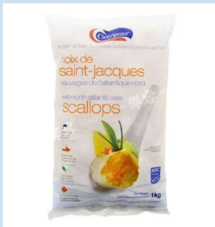
SCALLOP CANADIAN 20/30 R/OFF 1KG