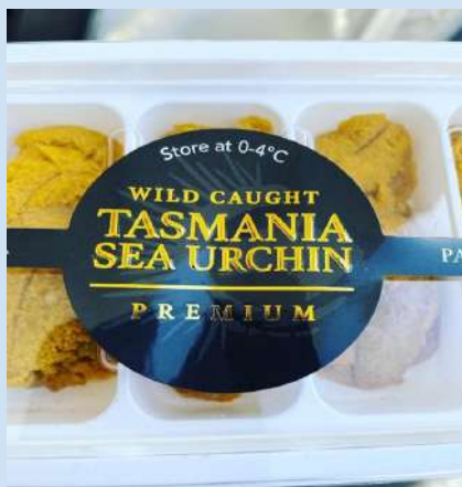
SEA URCHIN ROE TASI SASHIMI GRADE