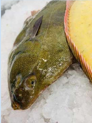
FLOUNDER Y/BELLY WHOLE 400/500GM PLATE R/W NZ