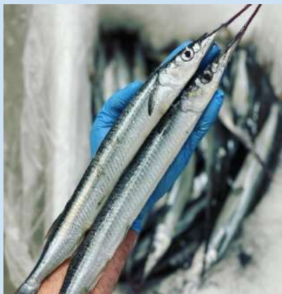
GARFISH WHOLE SA PLATE 850GM + R/W