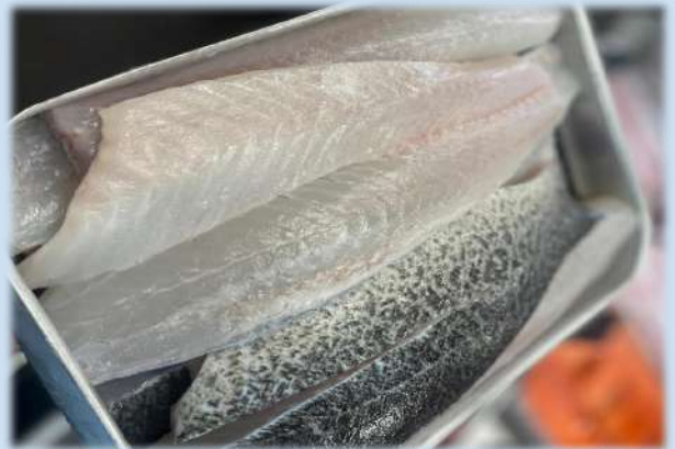
MURRAY COD FILLET S/ON LARGE 250GM + R/W